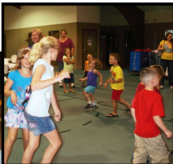
Left: SOS kids practice their listening skills while they work some muscles!